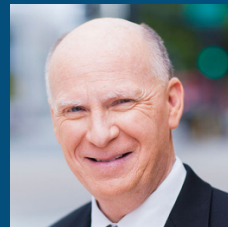
HON. PETER LYNCH